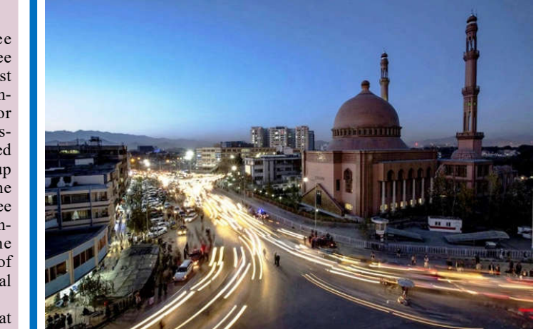
KABUL: The Kabul city new master plan was evaluated in a conference with the heads of the Islamic society, Afghan culture and traditions. Mawla Hamidullah Noman, acting Minister of Urban Development and Land, chaired a joint meeting to evaluate the master plan of the new Kabul city. The meeting was attended by representatives from ministries, related departments and engineers, the ministry's press office said in a statement the other day. At the outset, the participants briefed about the approval of the cabinet meeting, and representatives of ministries, departments and independent institutions expressed their views regarding the new master plan to the minister saying that the plan was very comprehensive and was prepared in accordance with Islamic standards, according to the statement. To conclude with, the needs and standards of Islamic society and Afghan culture were confirmed in the new Kabul master plan, and it was decided that detailed plans should be made in consultation with the relevant departments.